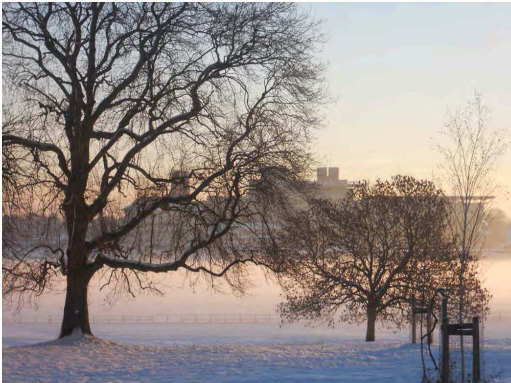
The Knavesmire, part of Micklegate Stray and an important part of York's green infrastructure.

6.30 Its relevance lies in the conglomeration of layers and relics of old landscapes, in part conserved through time by continuous administration, absence of development, and centuries of traditional management. It is the combination of the various elements such as the lngs and strays that provides York's unique make up. The natural environment is significant in its concentrated collection of a variety of examples of historically managed landscapes, represented for example by wild flower meadows, lowland heath, valley fen, strip fields, veteran orchard trees, species-rich hedgerows. Many of these otherwise isolated remnant landscapes link up with other open spaces resulting for example from our industrial or war time past, to form often accessible tracts of subtly diverse landscapes; thus the landscape/natural heritage is much greater than the sum of its parts.