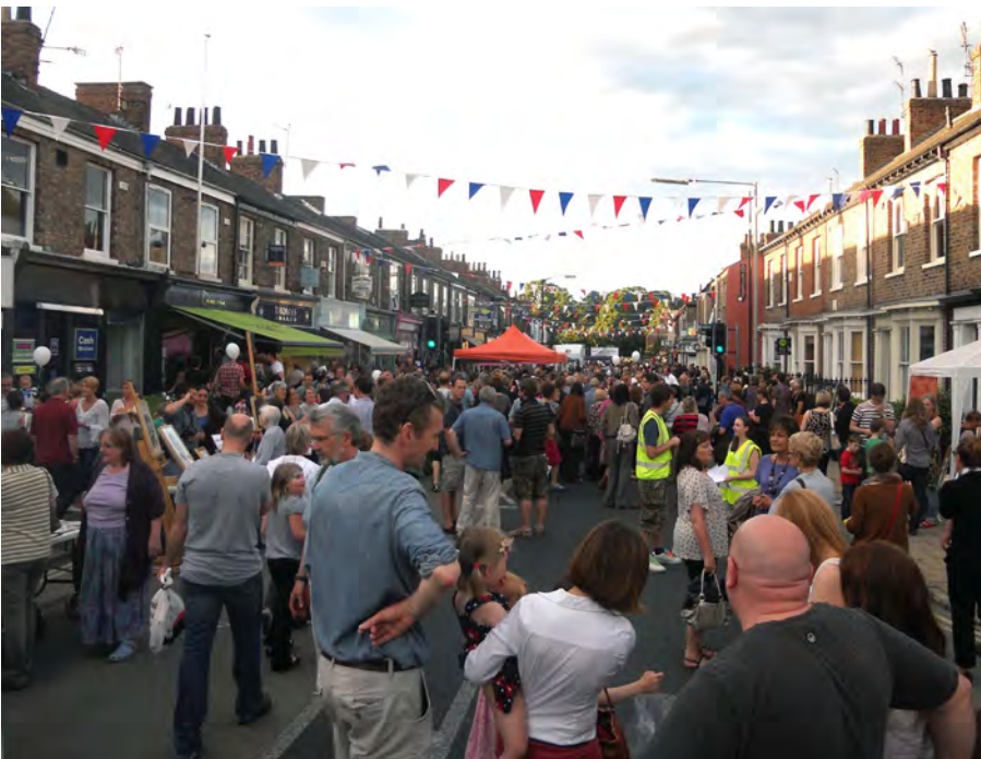
The thriving shopping centre of Bishopthorpe Road during an annual street party.